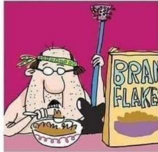
Earth, Wind and Fiber