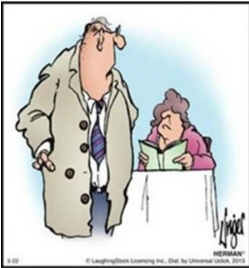
"I see you finally sewed on my button."