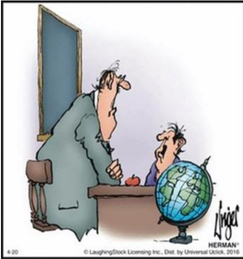
"The capital of Holland is 'H.'"