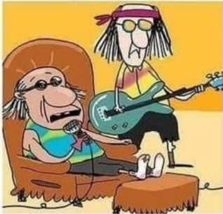
The Grateful we're not Dead